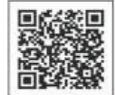
LEARN ABOUT THE AUTHORS OF OUR PARISH COMMUNITY

Of late, when I pray, I have embraced a new prayer posture: turning my hands downward, resting my palms on my knees. It helps me remember that with Jesus as my shepherd, I "shall not want." I already have all I need. ●